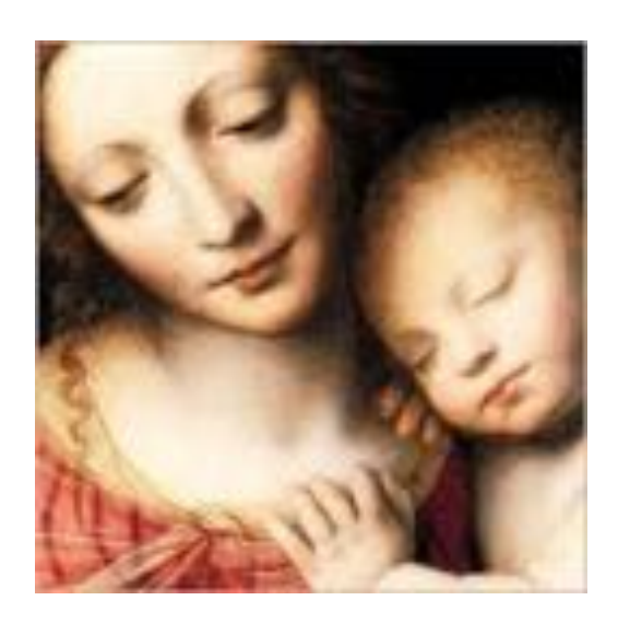
Elspeth McVeigh sings an acapella programme of early Advent and Christmas music at Rosslyn Chapel 1.00pm Thursday December 2 Wednesday December 15