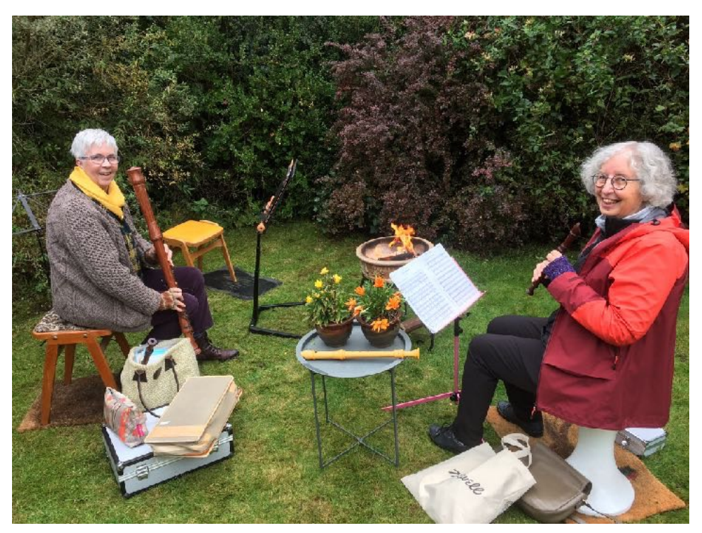
Two members of the Lockedown Consort, well wrapped up and warmed by fire and flowers

However, it was in a mixture of frustration and hope that I contacted two of my consort players to arrange to play live music in my back garden round a fire-bowl, and on August 24<sup>th</sup> 2020 The Lockedown Consort was born. Naturally enough we played music by Matthew Locke, but also lovely consort music from the 15<sup>th</sup> to the 18<sup>th</sup> century – to be honest, it was a particular delight just to be able to enjoy and try out repertoire without having half an eye on a concert programme. Over the ensuing months, the weather has been generally very kind to us, and we have been meeting periodically since then, and thoroughly enjoying the purest kind of consort playing.